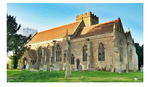
ALL SAINTS CHURCH meets in the historic church building on Willen Road in Milton Keynes Village. www.allsaintschurchmkvillage.co.uk